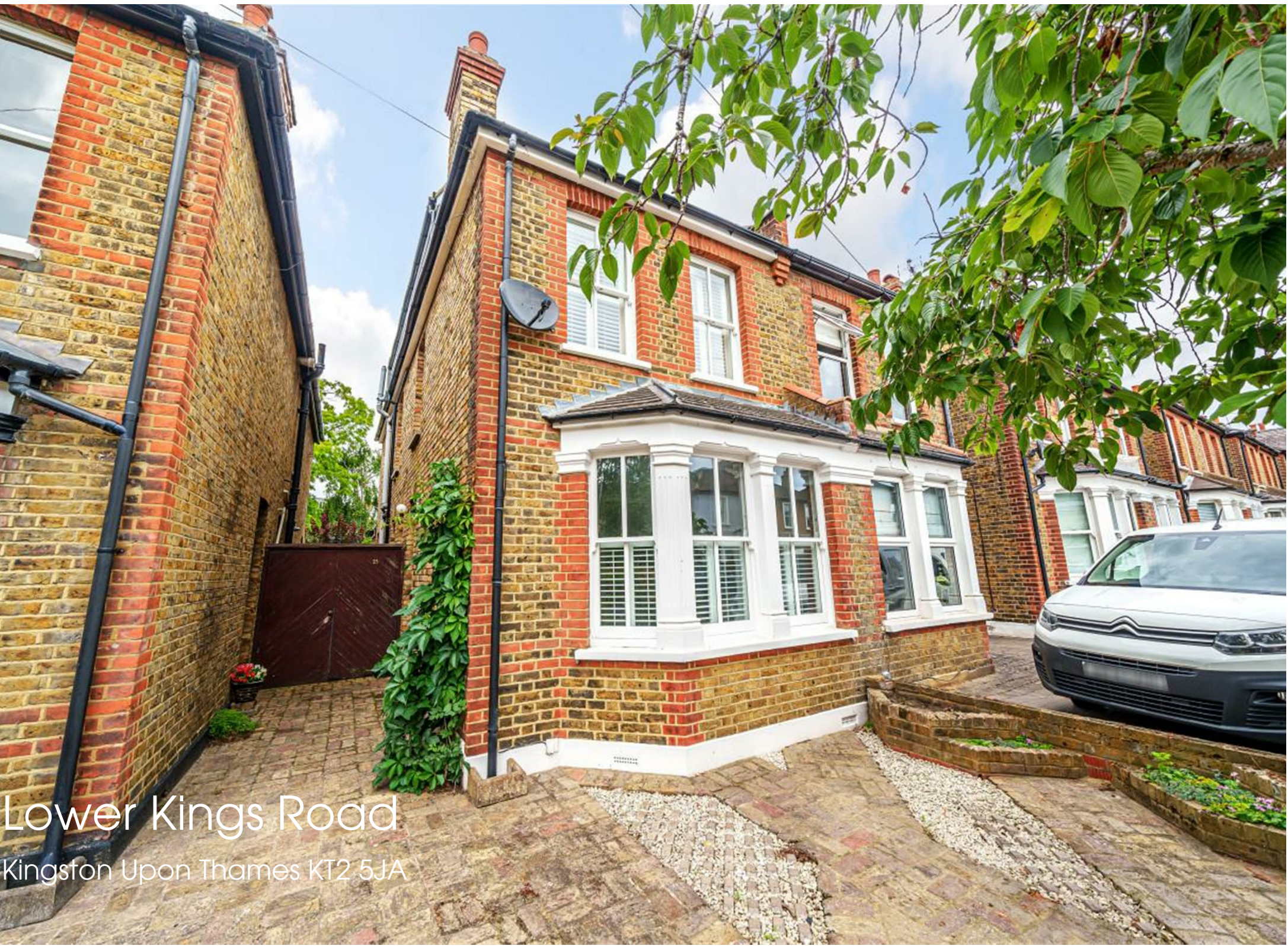
Lower Kings Road Kingston Upon Thames KT2 5JA